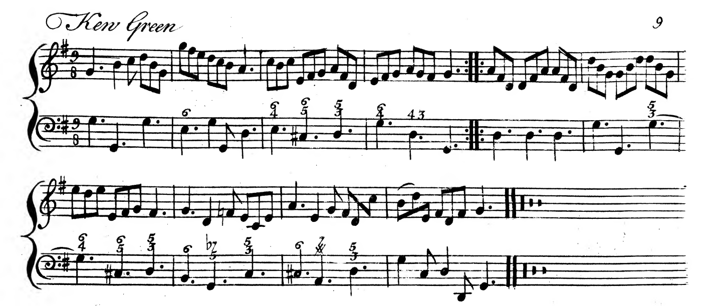
First Couple cast off one Couple and Back to Back then cast up into their Places & Back to Back -Take Hands and lead down the Middle below the 3<sup>d</sup> Couple & cast up into the 2<sup>d</sup> Couple's Place then lead up a breast with the 2<sup>d</sup> Cu. & cast off into the 2<sup>d</sup> Couple's Place & turn -